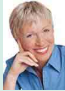
Barbara Corcoran The Corcoran Group