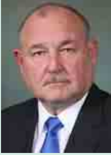
Adm. Thad Allen USCG (Ret). National Incident Commander